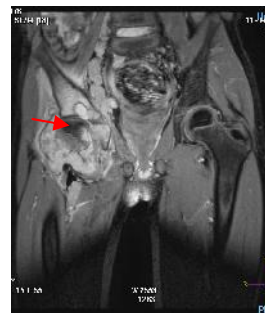
TB osteitis of right hip